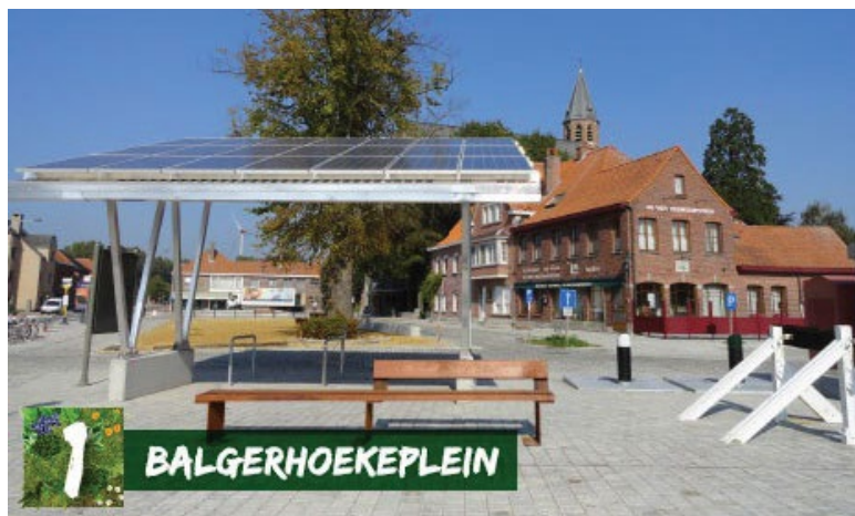
Ecopower has reinvested part of their profits to benefit the community with this e-bike charging station.

Ecopower supplies the energy to their members at a reasonable price and offers the chance for people to make small or larger investments in renewables depending on their own financial circumstances. Through initiatives focused on energy efficiency, Ecopower's members have reduced their electricity consumption by an average of 50% over the past 10 years.