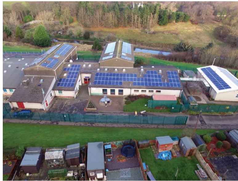
The solar panels generating energy on this school in Scotland are lowering the energy bills of the school and creating revenue for the local community

At the second AGM a small income was received by the cooperative and the members voted to distribute the surplus towards adding educational display panels to entrance halls of the host buildings.