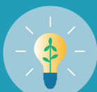
figure out what type of project is best suited for you depending on your context